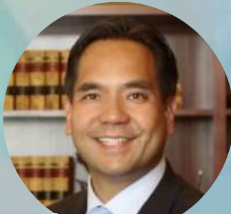
Sean Reyes Utah State Attorney General